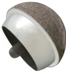
CGI Image of Cobalt Chrome Femoral Component with Crosslinked Polyethylene Custom made Hip Resurfacing.

"We cannot do this testing in-house. It requires access to a specialist laboratory environment and also to the right skills."